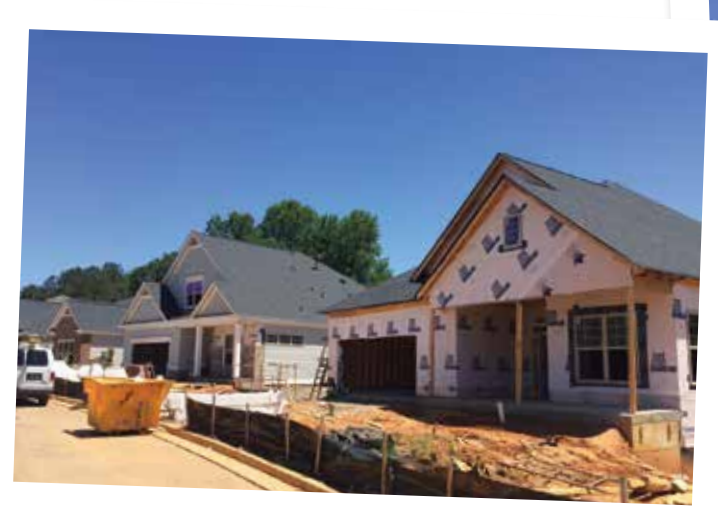
Detached Cottage Condominium Homes at Big Creek