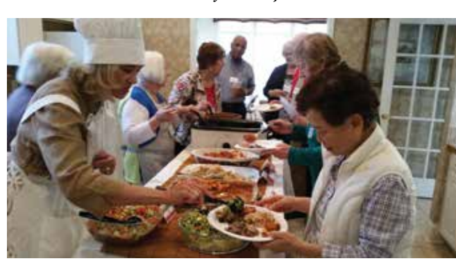
The Orchards of Windward -International Buffet