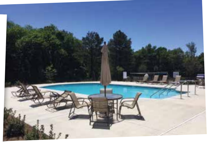
Grand Opening of The Pool and Clubhouse at Big Creek

With the Grand Opening of The Orchards of Big Creek behind us, we are pleased to announce that not only have the first 10 homeowners closed on their new homes, the community Grand Clubhouse and Pool are now in full operation and use as well. Adding to that, we recently completed the 3 Villa Townhome models creating 5 professionally decorated model homes available for touring 7 days a week.